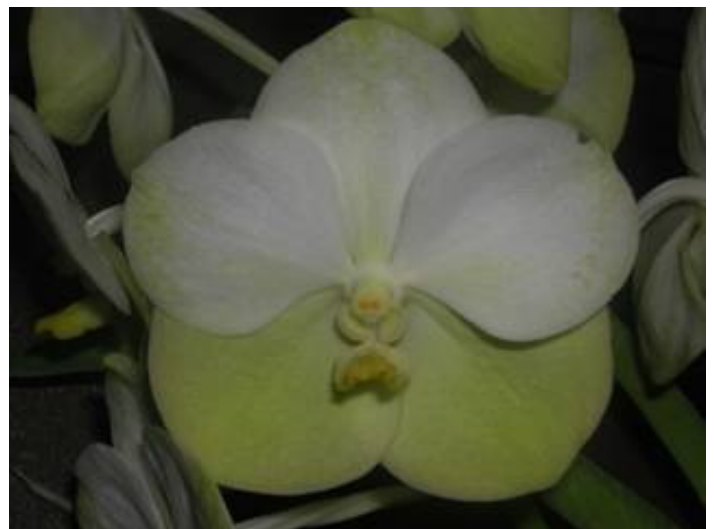
Ascda. Crownfox Sunshine 'Norma' X Ascda. Fuchs Yellow Snow 'Norma' → Displayed by Jack Majewski