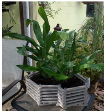
Gram Scriptum Var. Citrinum "Hihimanu"