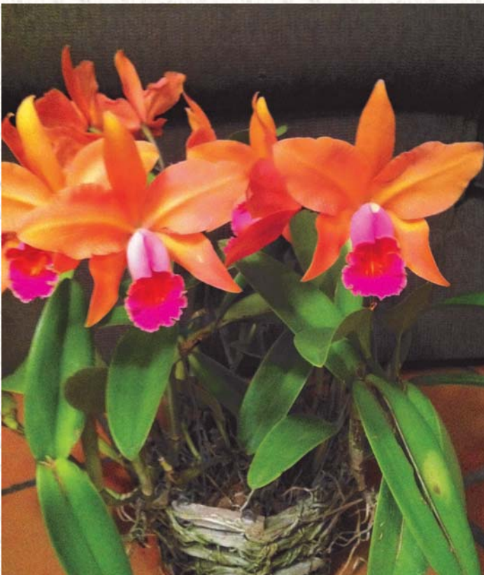
Left: Blc Goldenzelle 'Ambrosia' X C forbesii 'Lucent Green' Grown by: Jennifer Upchurch