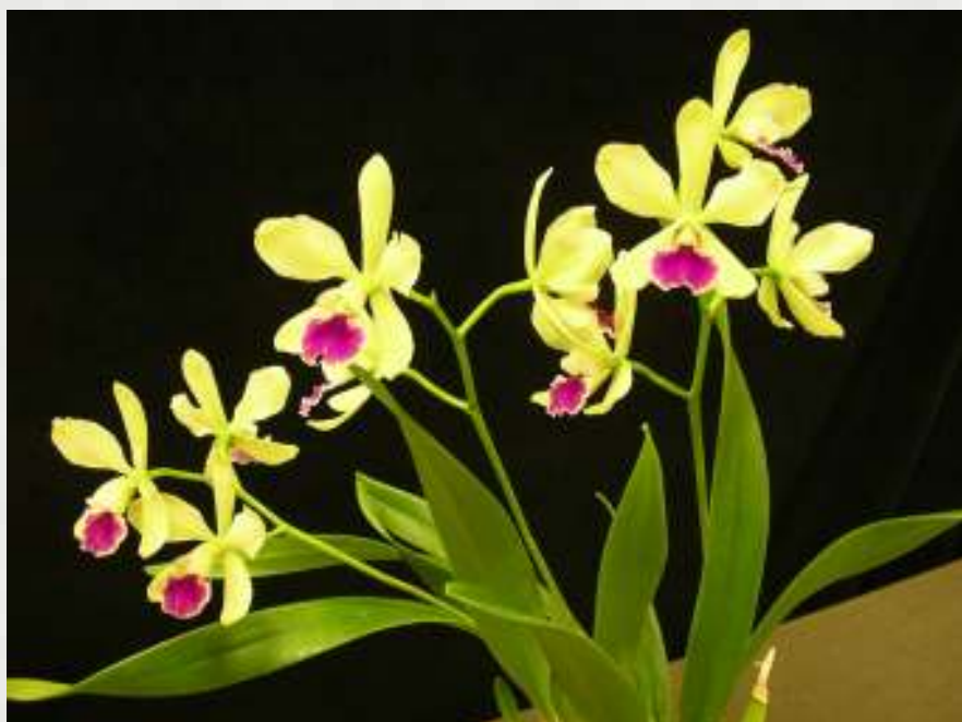
Epicattleya El Hatillo 'Pinta' - Jenifer Upchurch